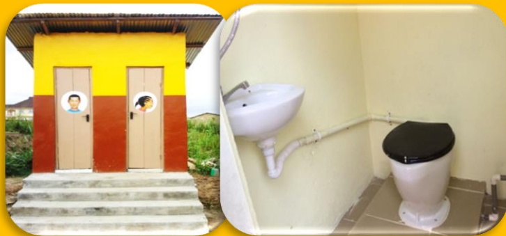
MICROFLUSH TOILET PROJECT

Although Ghana ranks 152 out of 182 on the Human Development Index, it has the 4th lowest rate of sanitation coverage worldwide (UNICEF/WHO 2010). It is against this background that WPDG is training local youth on how to construct Eco Microflush Toilets that uses only one cup of water to flush. In 2016 many of such toilet were built by our trained youth in Ghana communities such as Kpedzie, Pokuase, and Bremuso to help combat poor sanitation situation in such communities. The picture shows one of our Microflush toilets.